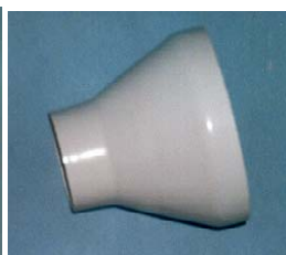
Transformation 60 mm / 100 mm