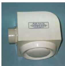
Ceiling Diffuser fitted to Box 90°