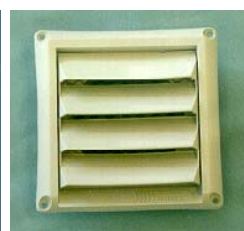
Wall Grille 100 mm