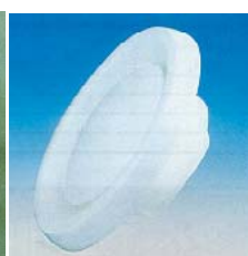
Ceiling Diffuser 100 mm or 150 mm